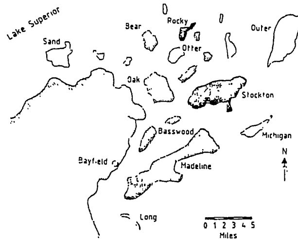
Fig. 1. Apostle Islands National Lakeshore and estimated deer densities of the Islands during the mid-1950's. Estimates are based on Beals et al. (1960) and Brander (1983). □ None; ◻ Low; ◻ Medium; ◻ High

I sampled Canada yew on four islands that had different deer histories: Basswood Island; Rocky Island; Otter Island; and Outer Island. I chose these four islands because they supported similar vegetation, but had different deer histories. Basswood Island, for example, still has deer and yews on this island show sign of chronic,